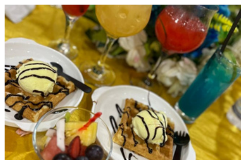
Super Sabbath Lunch