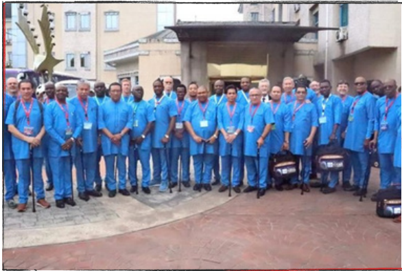
Delegates and Observers for COG7 International Federation in Session