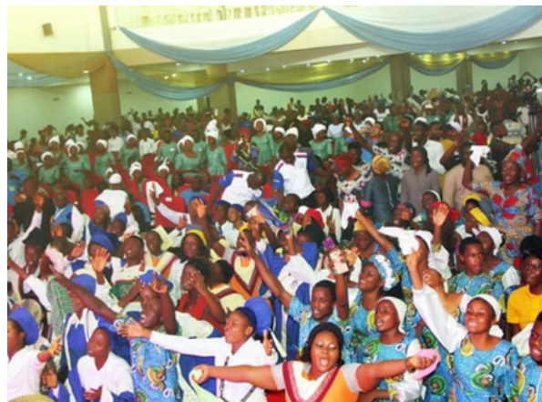
Super Sabbath Worship