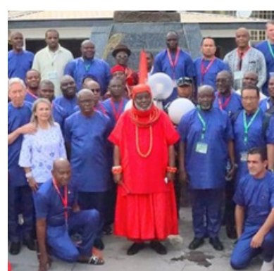
The Oba of Omoku