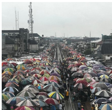
Three Mile Market