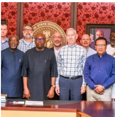
Governor of Harcourt